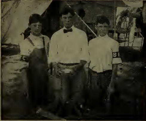
IOWA CORN CLUB BOY PRIZE-WINNERS.

In that school the schoolhouse is like a country home, with its garden, its shop, its kitchen, and its living room. Much of the day the children spend in the open air, either in the garden itself, or on the big piazza. In the shop, there is little formal manual training, but with simple tools the boys and girls make